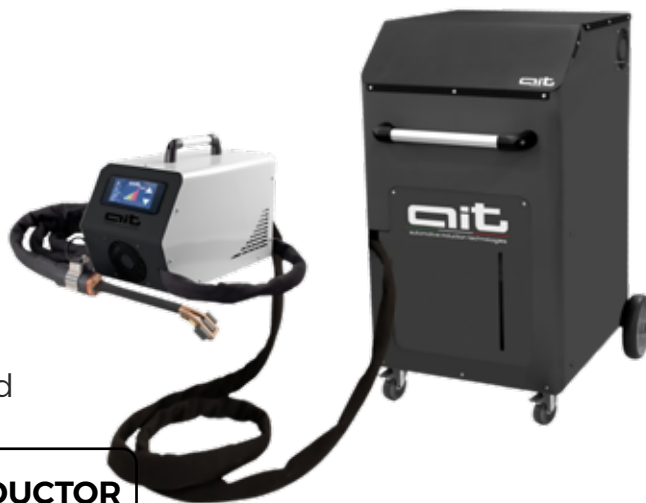
ART - HDi 16kW Runner